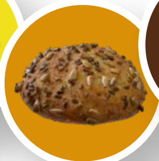
Sunflower bread roll